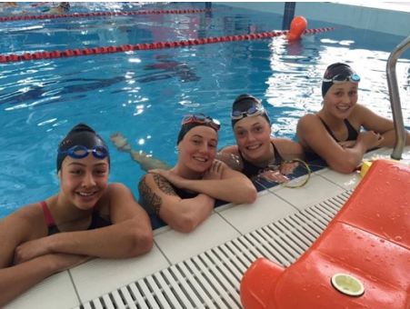
Right Photo: "The team after we broke the NZ record! 4x50 Obstacle" - Relay Team